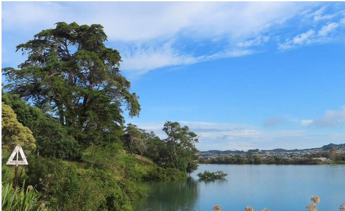
Our beautiful estuary at high tide

Monday, 16 May, 9.45 am , at the Salvation Army Hall, 32 Greenview Lane, Red Beach, Hibiscus Coast.