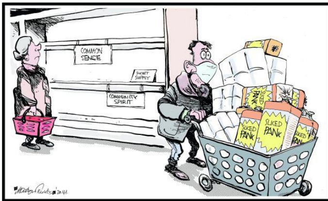
From the Irish Times. Finding that balance between being prepared and hoarding.